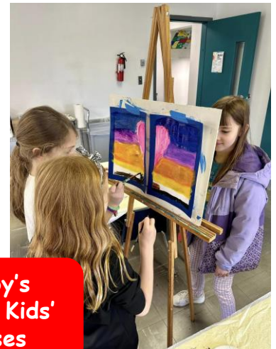
Gabby's Recent Kids' classes