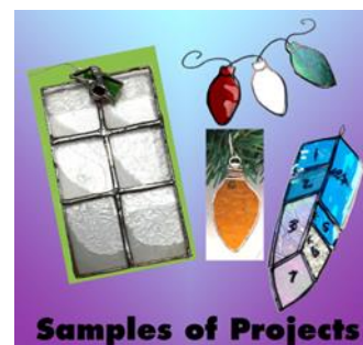
Samples of Projects

Beginning Stained Glass with Sherrie Sandell! 2 day class - October 24 & 25, 2023 - 6pm-9pm