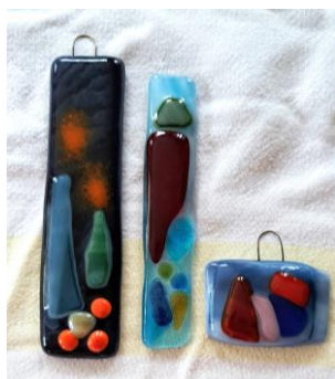
Glass fusion before & after firing.