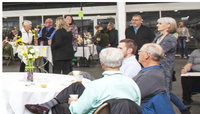
Matching up Rotary donations with Auction attendees. . .