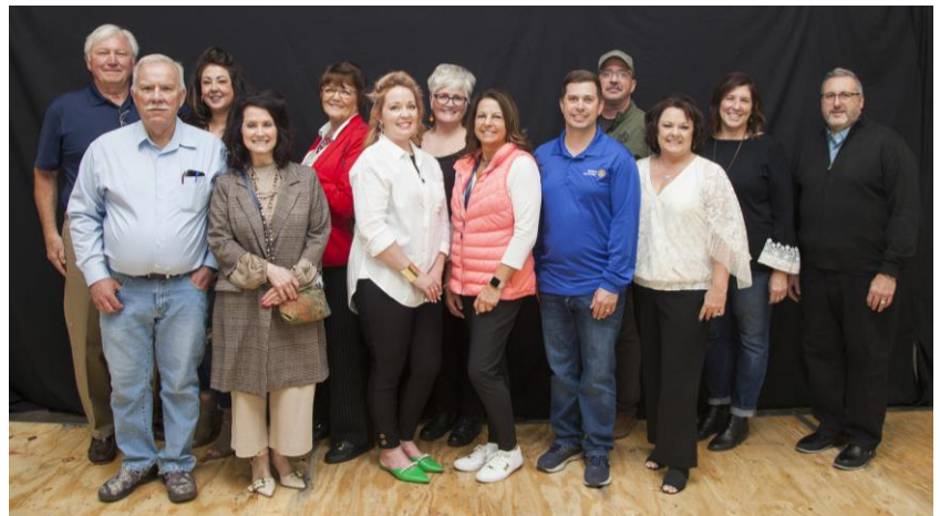
The Rotary Club's Auction Committee that made it all happen!