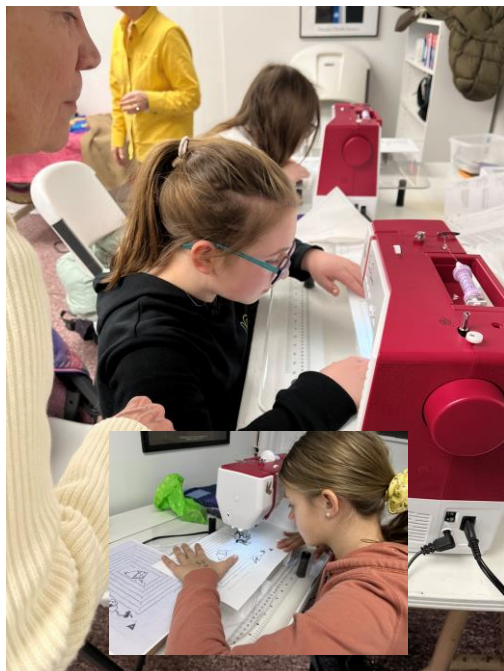
Kids & adults having fun with art & games