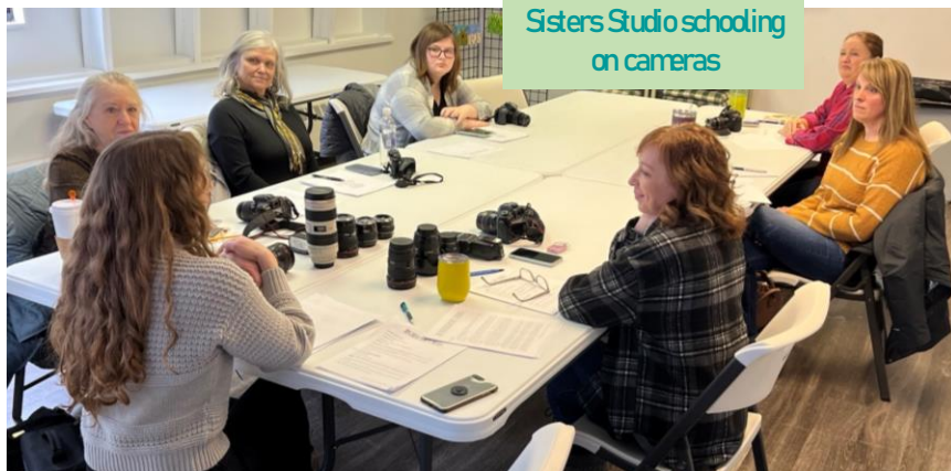
Sisters Studio schooling on cameras