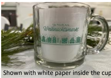
Shown with white paper inside the cup