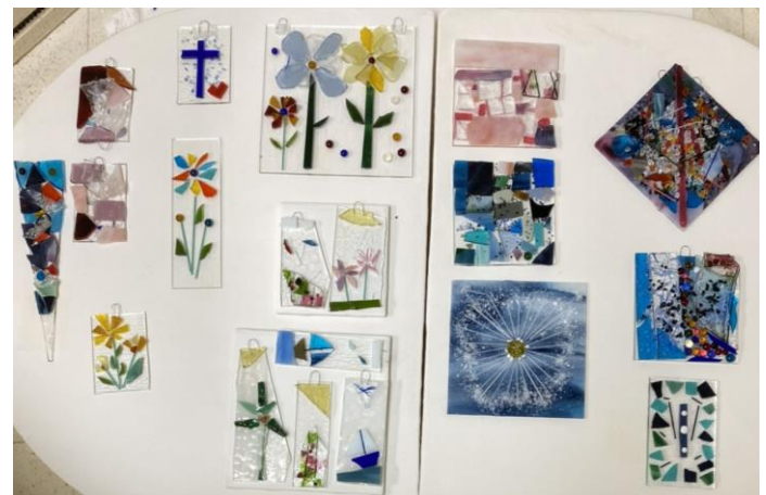
Different students, different ideas - fusing glass into art.