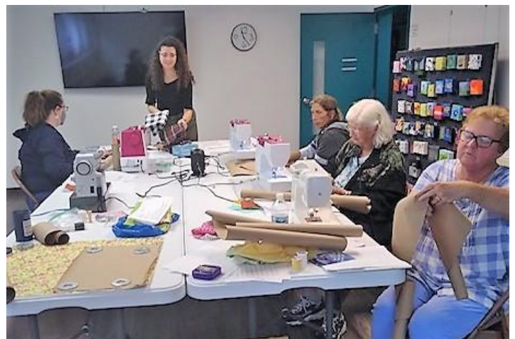
Adult sewing class taking shape