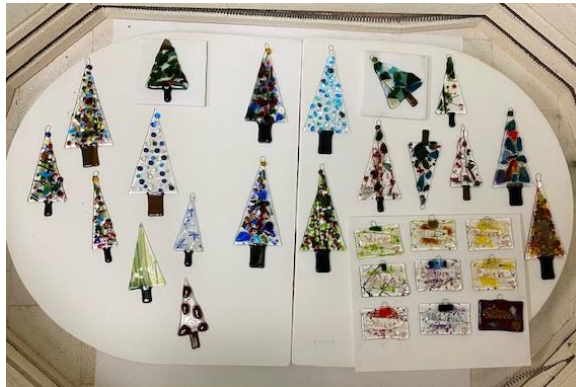
Fused glass prep work (left) and finished ornaments in the kiln (above) ready for firing