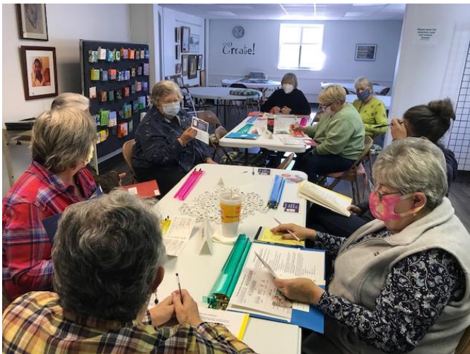
Mahjongg mixing fun with serious study