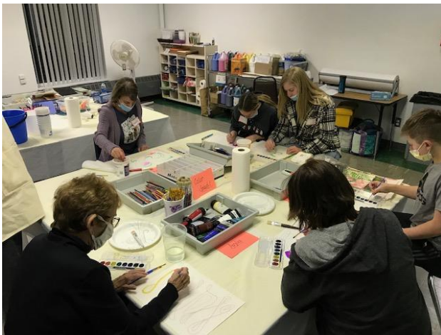
Art journaling at work