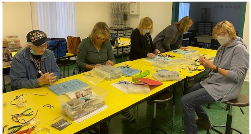
An array of materials sparked plenty of creativity in the Jewelry design class