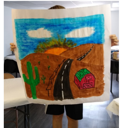
Paint the Tile 2020