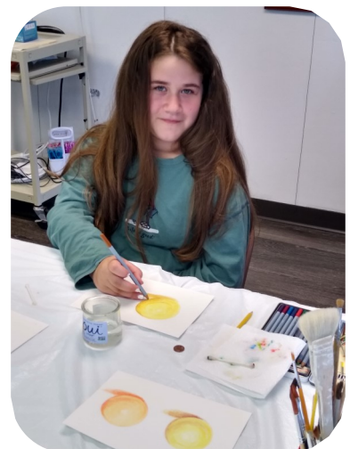
Watercolor pencil class in August'21

Every child is an artist. — PABLO PICASSO —