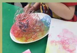
Sewing & Quilting Classes