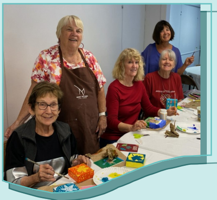
Painting tiny canvases for scholarship fundraiser.