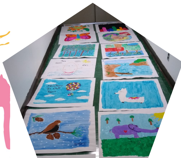
Some of the tiles from our 2020 event