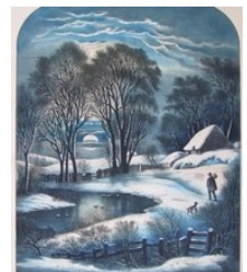
Currier & Ives Yale Univ Art Gallery